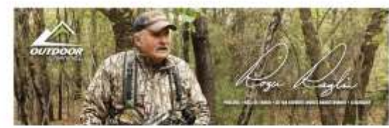
Special Music by 4forOne